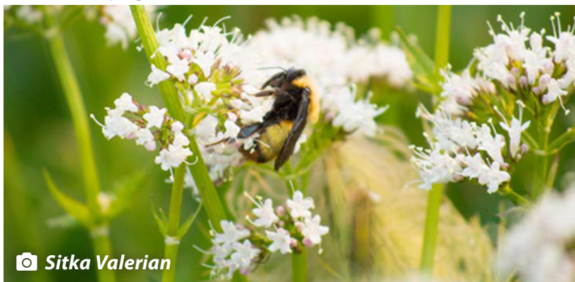
📷 Sitka Valerian

Fun Fact: Indigenous communities cooked and ate the roots. Some tribes also used the roots for their medicinal benefits, helping with inflammation and aches.