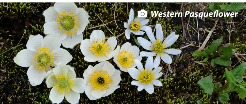
📷 Western Pasqueflower

Fun Fact: The seed heads are so distinctive that common names for this flower include mop-top and nature's hippies.