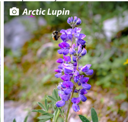
📷 Arctic Lupin