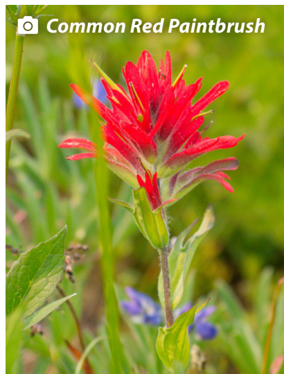
📷 Common Red Paintbrush