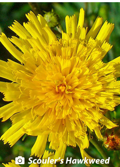
📷 Scouler's Hawkweed